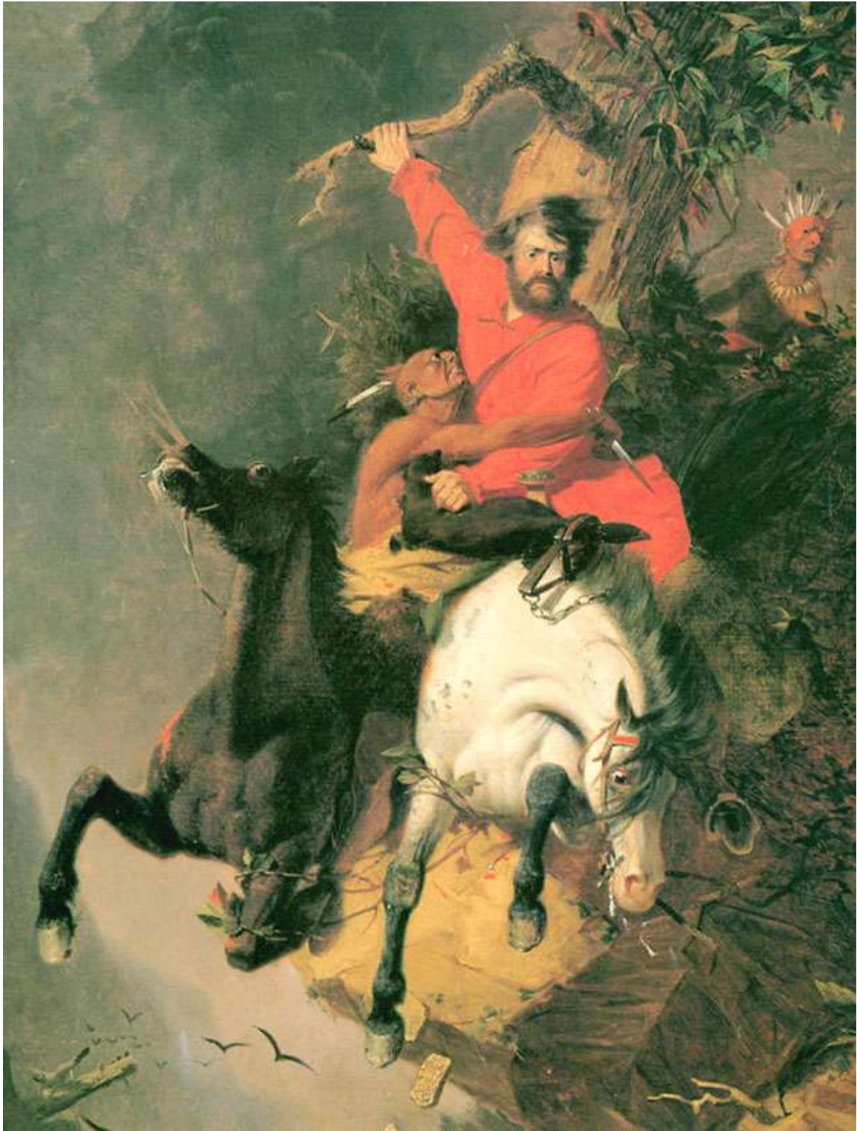
(Artist: Charles Deas Date: 1847)