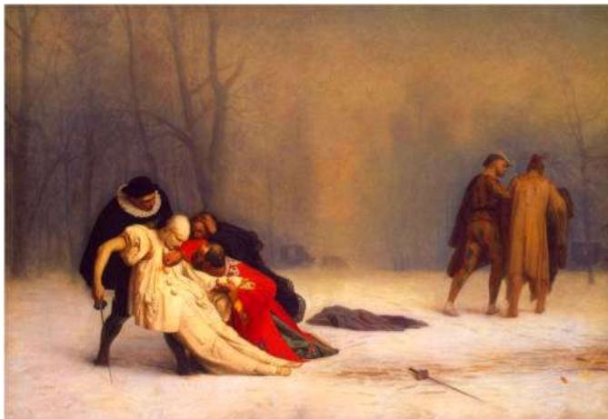
(Artist: Jean-Leon Gerome Date: 1859)

The Satan shall see his reflection in the heart of mortals on the day of reckoning.