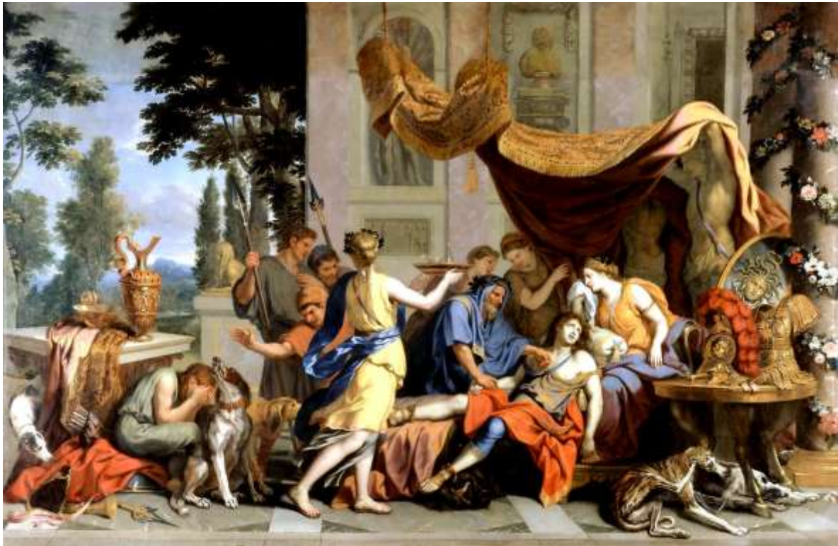
(Artist: Charles Le Brun Date: 1619-90)

The mortals shall bury the evil in their souls in the graveyard of eternity on the day of judgement. The mortals shall purify their soul by diving into the sea of purity on the day of judgement. The mortals shall fill themselves with grace by dipping into the sea of purity on the day of judgement. The mortals shall dip into the stream of divinity on the day of judgement. The mortals shall discard the bitterness of separation on the day of judgement. The mortals shall find their chosen place in the shelter of divinity on the day of judgement. Be sure! The mortals shall rewrite their fate with the divine pen on the day of judgement.