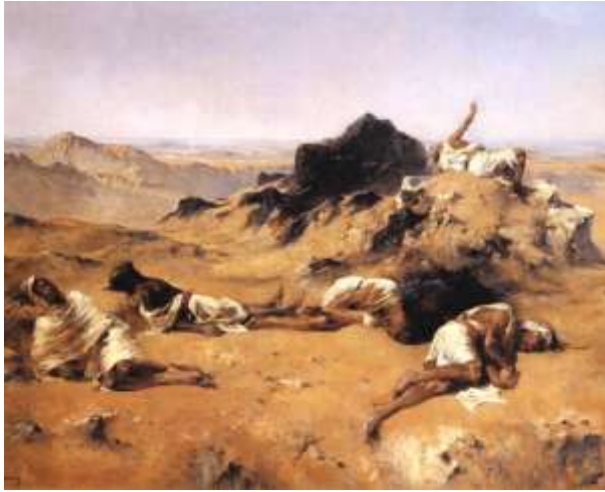
(Artist: Eugene Fromentin Date: 1820-1876)