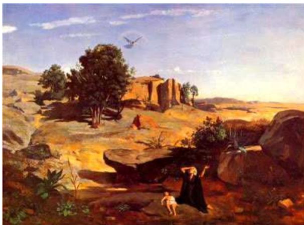
(Artist: Camille Corot Date: 1835)

The mortals shall finally find the everlasting wealth in the land of plenty on the day of judgement. The mortals shall finally shed their knowledge on the day of judgement. The mortals shall be guided to the path of divinity on the day of judgement. The mortals shall write with pen of divinity on the pages of eternity on the day of judgement. The mortals shall defeat the evil forces arising from the valley of darkness on the day of judgement. The mortals shall rewrite their destiny with the divine pen on the day of judgement. Be sure! The mortals shall rewrite their fate with the divine pen on the day of judgement.